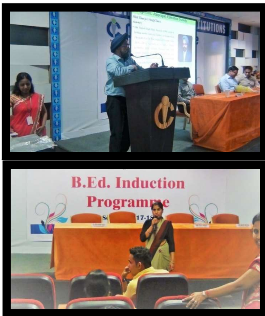
Figure 1 Induction Programme 2017-18