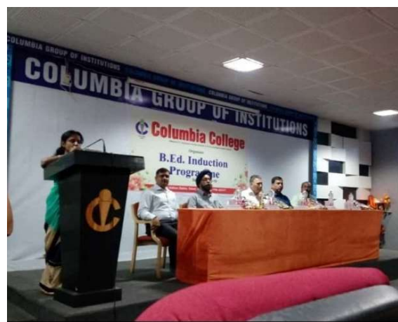
Chief Guests, Vice-Chairman & Secretary of JPES, Principal, Faculty Members and Students of 1st and 3rd Semester of Columbia College in Induction Programme 2018-19