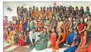
Students posing for a group photo session after the induction-cum-welcome ceremony at Columbia College of Education.