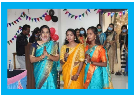
Picture 2: Welcome song by seniors